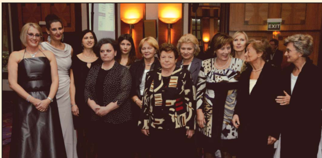
Photo: Coauthors of the monograph in honor of the 60th anniversary

Publishing activities of the CSMBLM are related to the society's scientific journal Biochemia Medica ( www.biochemia-medica.com ). It publishes articles by Croatian and international authors, dedicated to professionals from laboratory medicine and various fields of biomedicine that share the same interests. BM is indexed in Medline, SCIE, JCR, Thomson